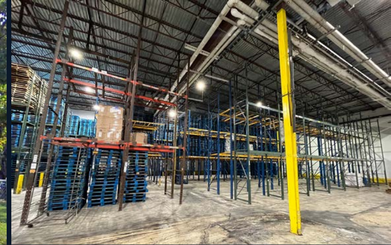
Temperature Control + Push Back Racking Cooler + freezer with $1M racking system