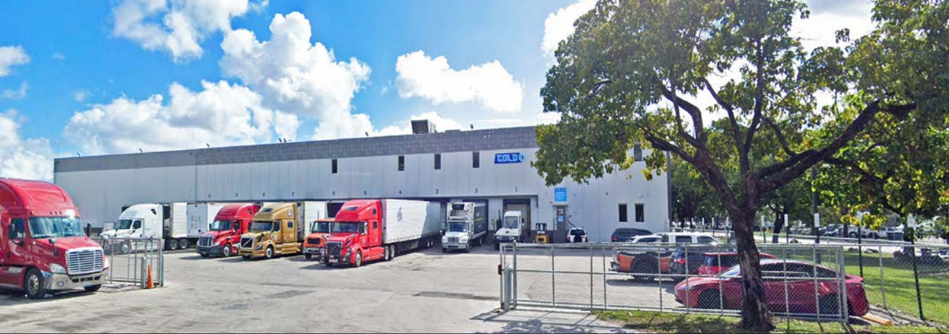
10 Dock-High Loading Positions Configured for refrigerated trailer operations